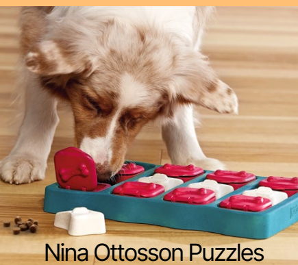
Nina Ottosson Puzzles

Cognitive Enrichment: Which includes: puzzle games, clicker shaping games or training sessions, snuffle mats as well as other games like hide and seek.