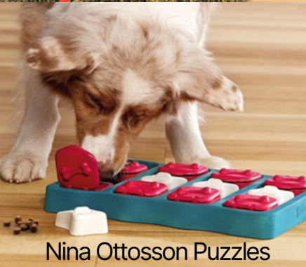
Nina Ottosson Puzzles

Cognitive Enrichment involves stimulating your dog's problem-solving skills through activities such as puzzle games, clicker shaping, training sessions, snuffle mats, and interactive games like hide and seek.