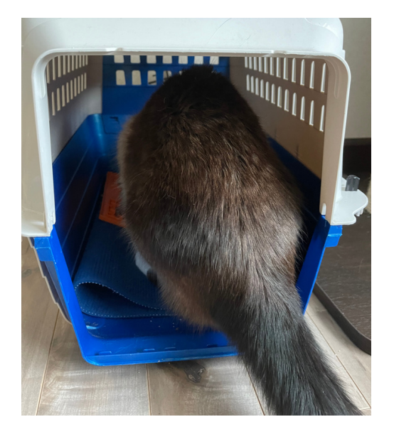
Step 3: Reward your cat every time they voluntarily go into the crate